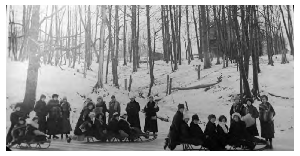
Students from St. Mary's Academy sledding and skating on Deer Creek on the Convent and Seminary grounds.

The creek continued north at this point, following South Delaware Avenue. When the creek reached East Estes Street, it detoured west a short distance, connecting with South Ellen Street. According to Arthur Hickman, in his memoir, Bay View As I Remember It , "this little detour was known as the 'Devil's Elbow'." Hickman claimed that the creek continued running north parallel to Ellen Street, actually "about 100 feet west of it." When the