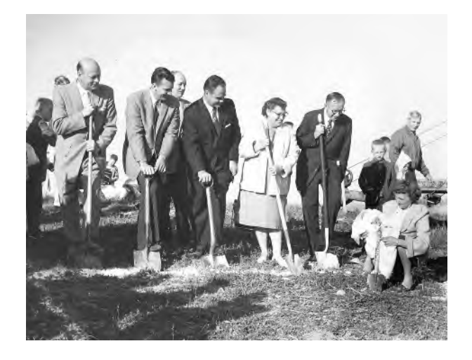
Ground breaking ceremony October 15, 1961

This is what I can recall of September 12, 1962, on the very first day of St. Francis High School. All the anxiety I felt back then has now turned into just sentimental feelings. It's amazing what we had to cope with, and it makes me wonder if today's St. Francis students will ever know or care what those first 302 students went through.