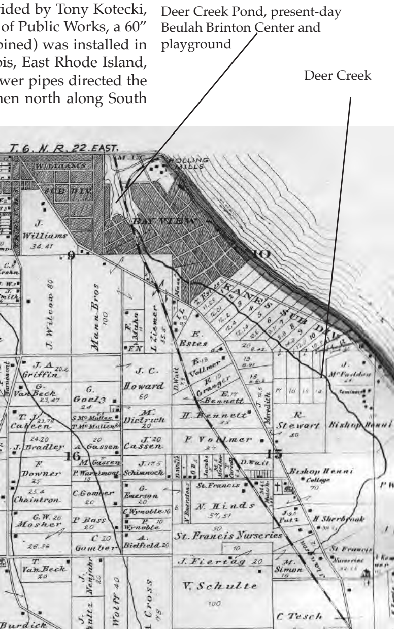
A portion of a map from the Illustrated Historical Atlas of Milwaukee County 1876. Deer Creek is clearly visible flowing north from the St. Francis Seminary into Bay View, through the area marked as Kane's subdivision into the pond (top center of drawing) west of the Rolling Mill.

https://bayviewcompass.com/bay-views-deer-creekforced-mostly-underground/